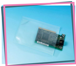
Clear Moisture Barrier Bag