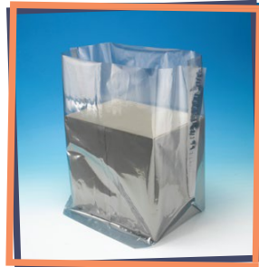
Square Bottom Static Shielding Bag