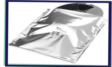
Aluminized Moisture Barrier Bag/ Dry-Pack (for packing semiconductor IC in tape & reel)