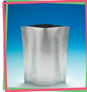
Bottom Gusseted AL Foil Bag (Standing Pouch)