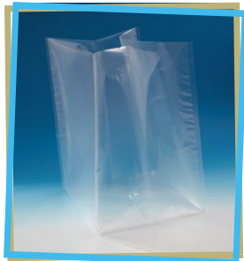
Square Bottom Clear Moisture Barrier Bag

All types of bag designed with various applications