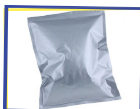
25kg AL Bag (for packing nutrition powder & other industrial product)