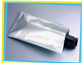
AL Foil Moisture Barrier Bag (for packing laserjet toner cartridge)