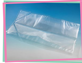
4 Side Seal Gusseted Bag with K-Bottom Seal (for packing wafer box)