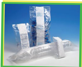
Clean room Clear Bag (for packing medical devices)