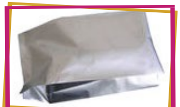
4 side seal AL Bag (for packing nutrition powder)