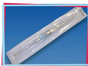
Clean room Clear Bag (for packing syringe)